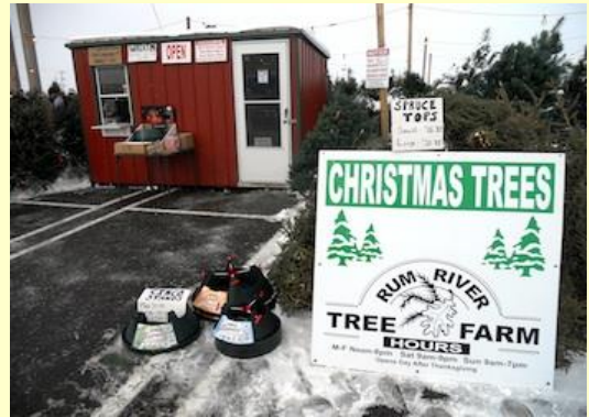
Rum River Tree Farm

Rum River Tree Farm is back in Marshall Terrace neighborhood for the holiday season! Once again, the Rum River lot in Northeast Minneapolis is located at 3075 Marshall Street NE ( the corner of Marshall Street NE and 31 st Ave. NE. )