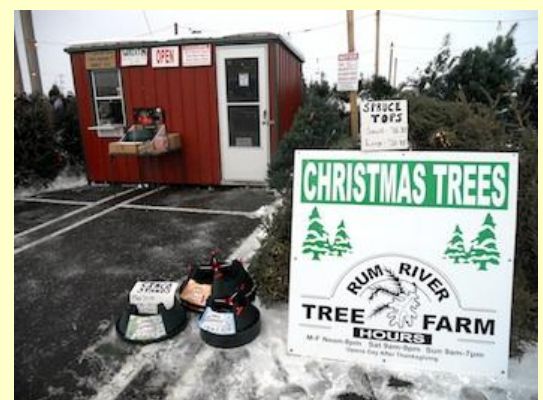
Rum River Tree Farm

More information at www.rumrivertreefarm.com .