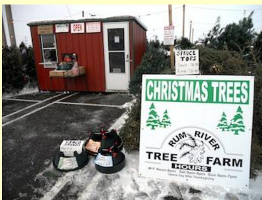
Rum River Tree Farm

Marshall Terrace residents are used to seeing the Rum River Tree Farm lot on the corner of Marshall Street and Saint Anthony Parkway at this time of year.