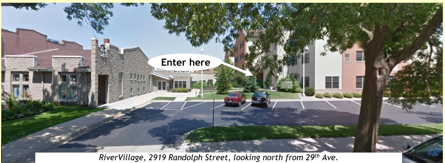
RiverVillage, 2919 Randolph Street, looking north from 29 th Ave.

All are welcome to attend and participate. This is a FREE event. Please join us!