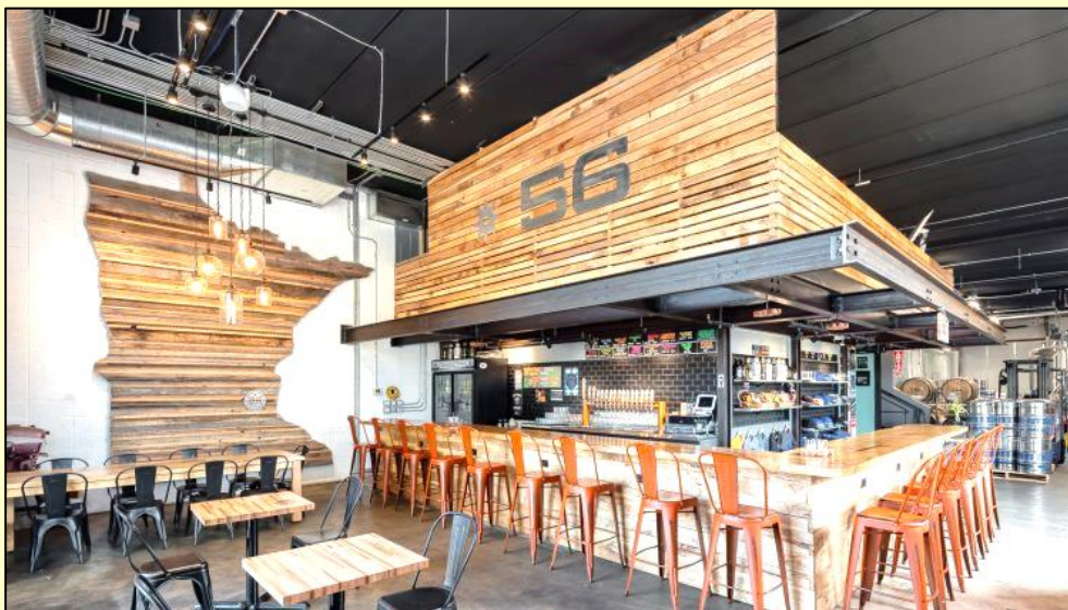
with our neighbors at 56 Brewing