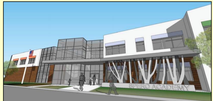
Rendering submitted to City of Minneapolis

Marshall Terrace residents are invited to tour Spero on Tuesday, October 2 nd at 6:00 PM followed by the MTNO monthly meeting at 7:00 PM. (Held at Spero this month only.)